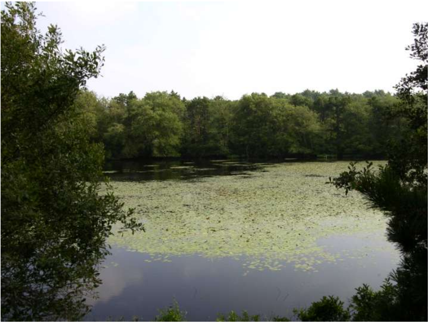
Coombs Pond from High Street