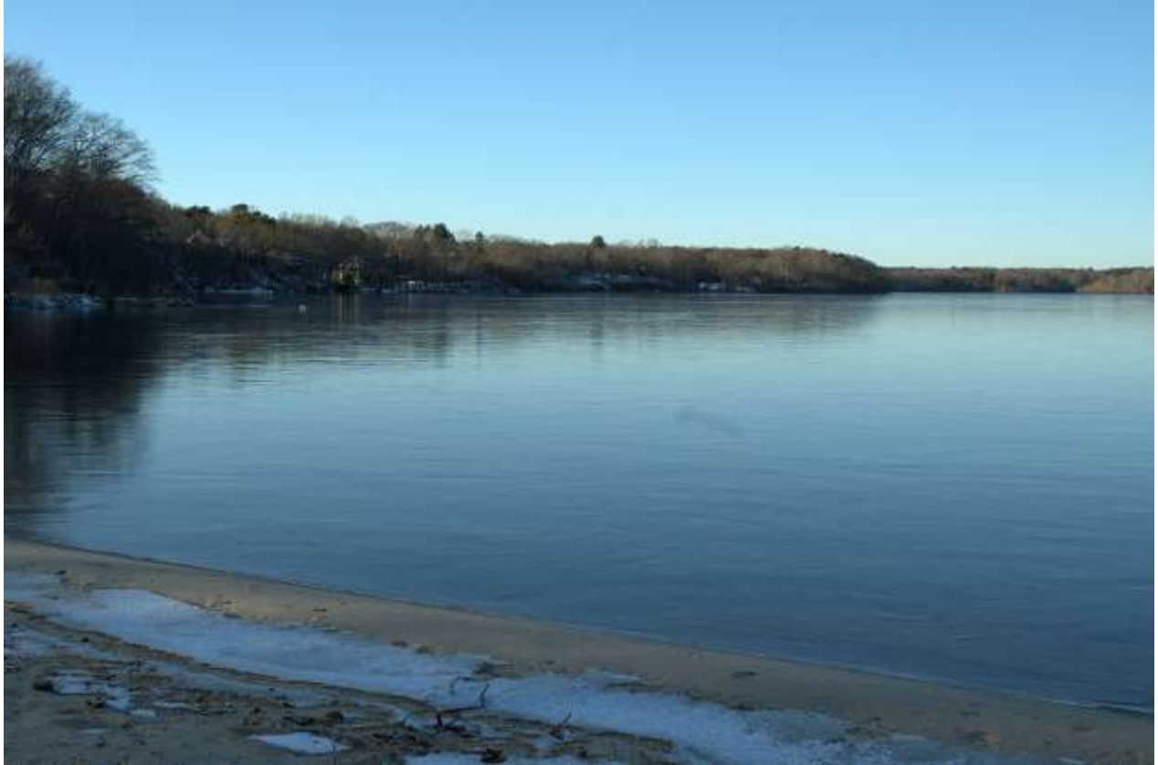
View from Attaquin Beach