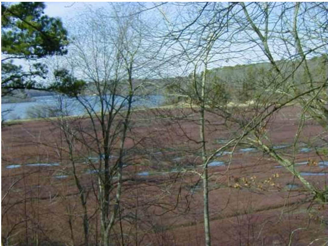
#1 Currently fallow bog irrigation from Santuit Pd(background), Drains to Lovells