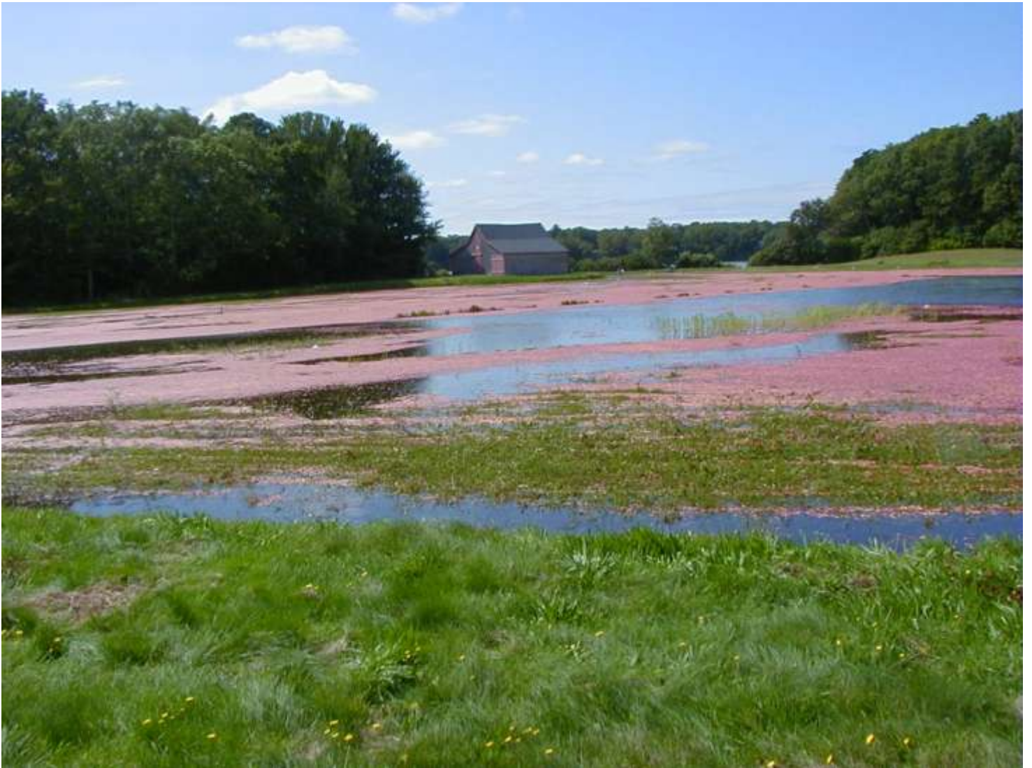
# 3 Working Bog at Harvest, Santuit Pond behind pump house. Fills from and drains to pond.