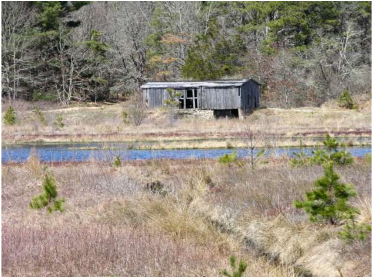
#2 Fallow bog also drains to Lovells Pond