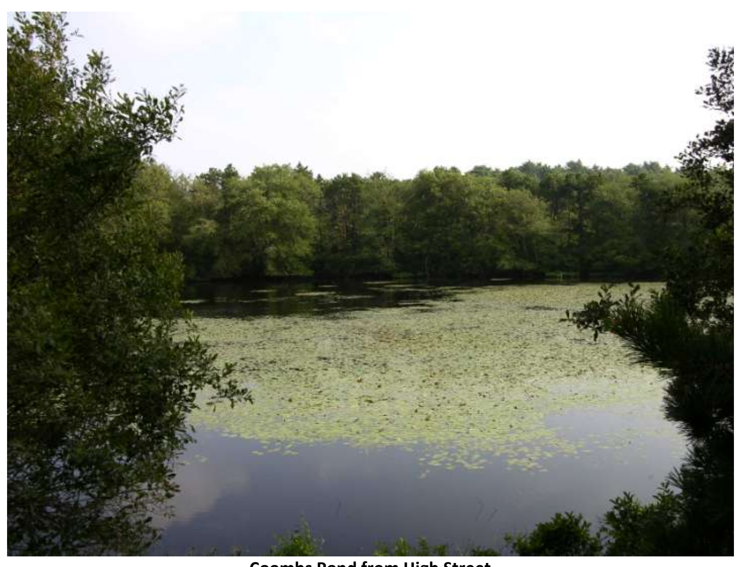
Coombs Pond from High Street