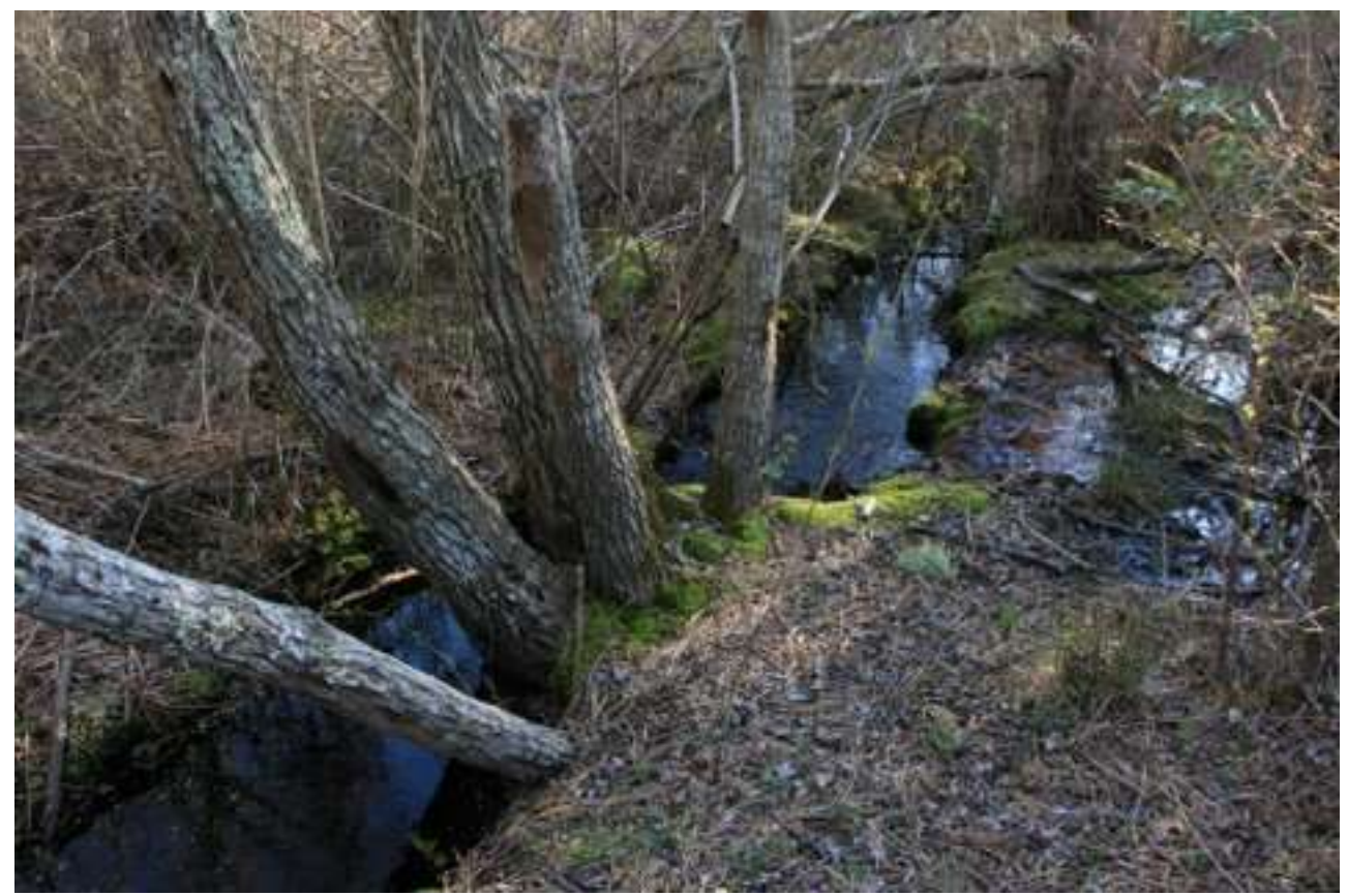
From Redbrook Rd viewing south