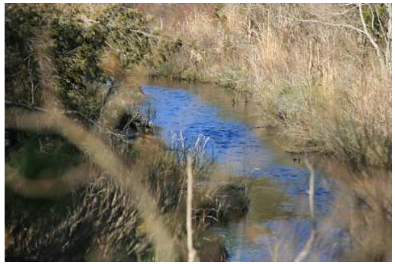
Near Monomoscoy Rd