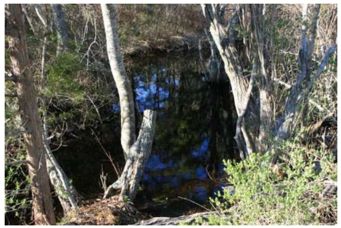
From Redbrook Rd viewing north