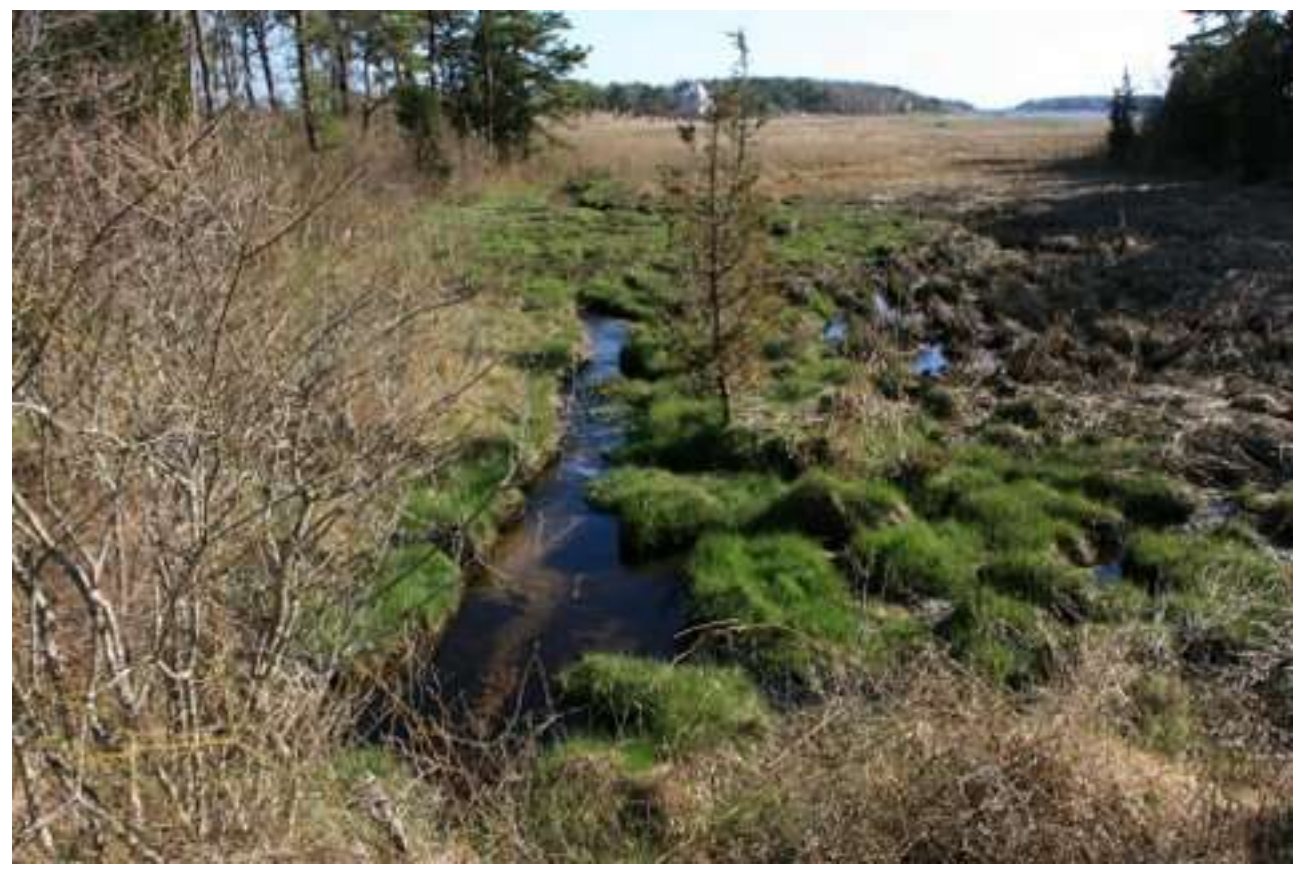
From Monomoscoy Rd viewing towards Waquoit Bay