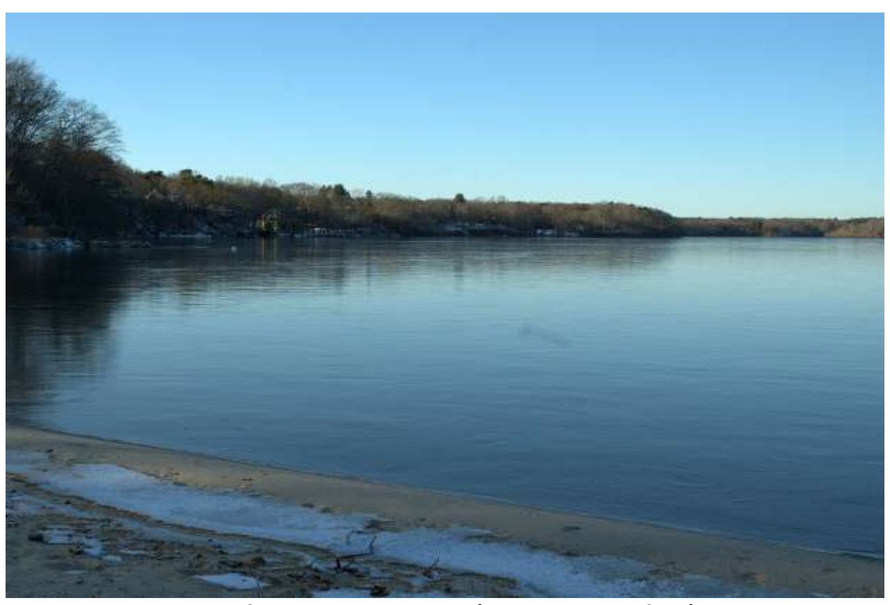
View from Attaquin Beach