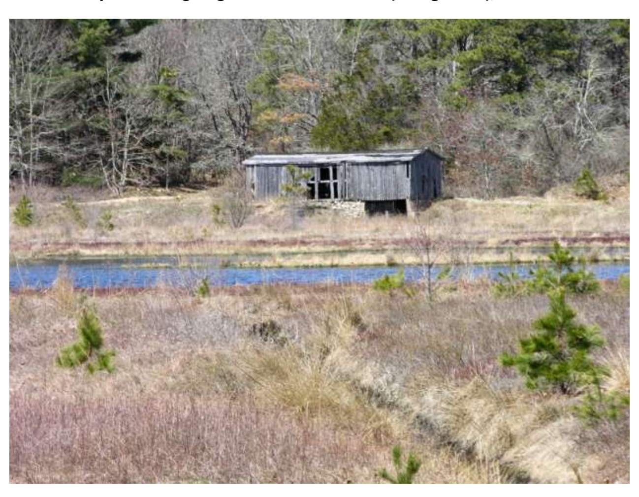
#2 Fallow bog also drains to Lovells Pond