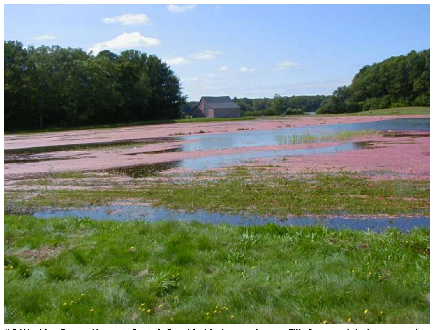
# 3 Working Bog at Harvest, Santuit Pond behind pump house. Fills from and drains to pond.